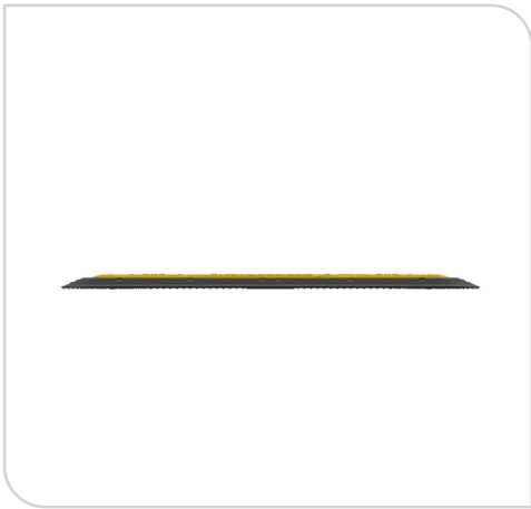
48mm Tall & Max Load 400kg