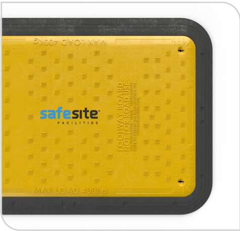
PVC Skirt for Increased Grip